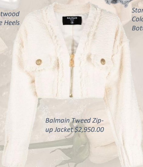
Balmain Tweed Zip- up Jacket $2,950.00