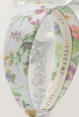
LELET NY Amelia Headband $148.00