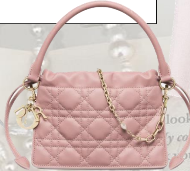
Dior Lady Dior Milly Mini Bag $2,200.00