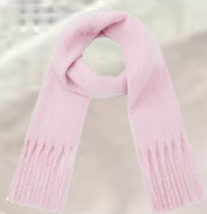
Urlazh Pink Oversized Fringe Scarf $68.00