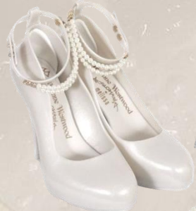
Vivian Westwood Pearl White Heels $225.00