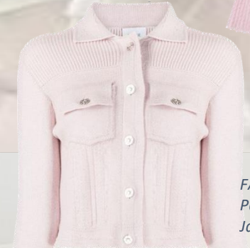
FARFETCH Ribbed Panel Knitted Jacket $2,445.00