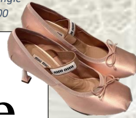
Miu Miu Satin Ballet Heel $1,050.00