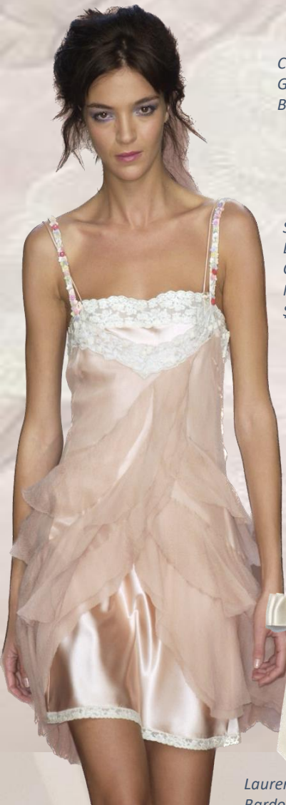
Mariacarla Boscono Blumarine 2004