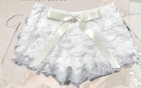
Starlight Fair Rose- Colored Ruffled Bottoms $42.09