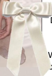
Lauren Hope x Bardot Bow Gallery Petite Silk Hair Bow $98.00

Dive deep into this Victorian Era inspired trend, with these gorgeous pastel pink and white pieces. From Vivian Westwood's signature pearls to Balmain's beautiful coats, take on this flirty and soft style, and unleash your true femininity