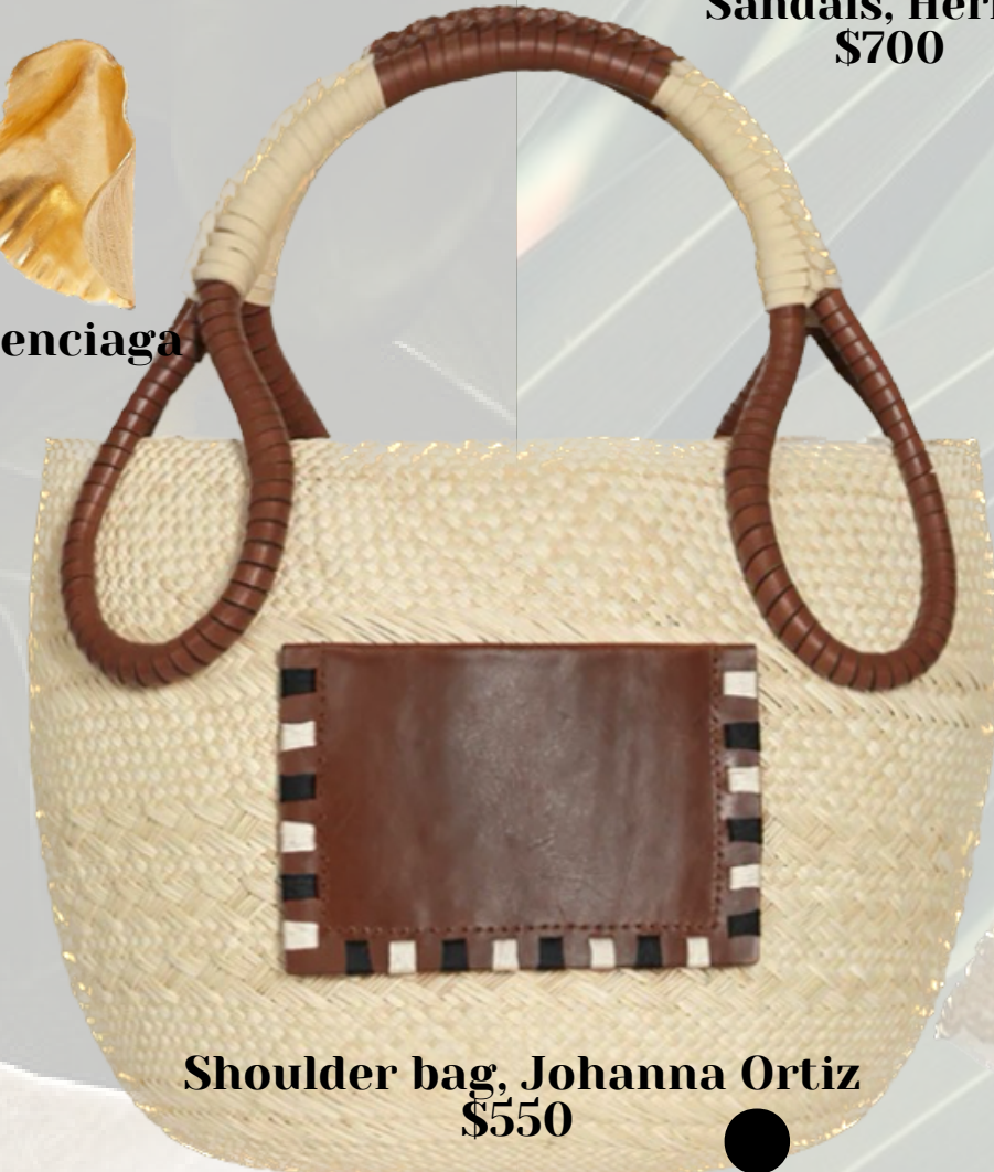
Shoulder bag, Johanna Ortiz $550