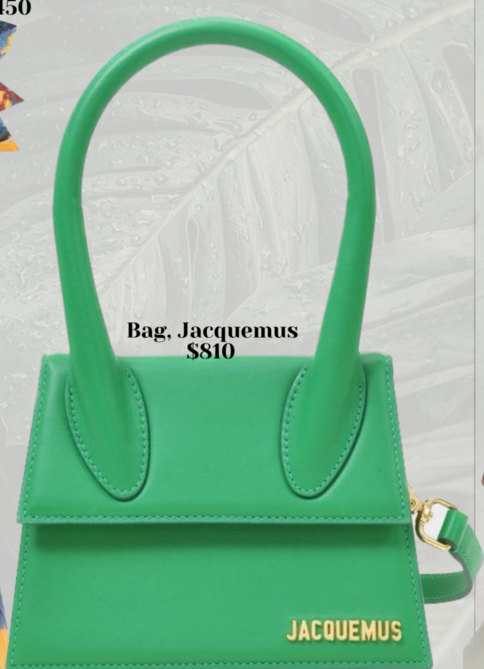
Bag, Jacquemus $810