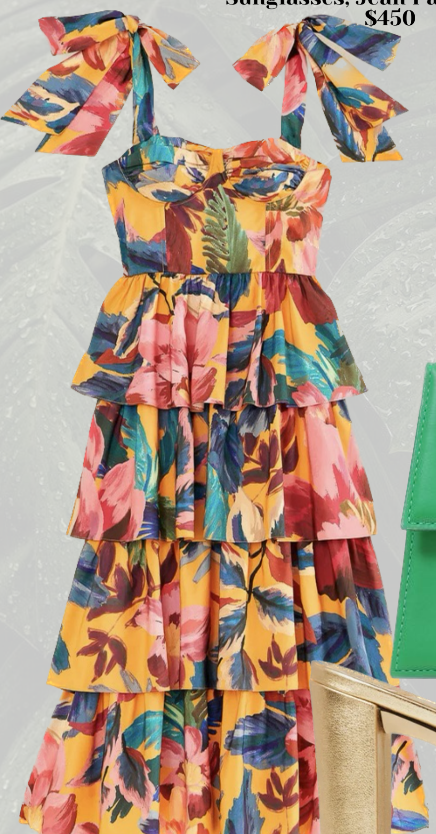
Maxi Dress, Farm Rio $320