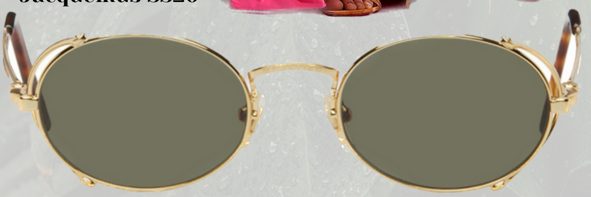
Sunglasses, Jean Paul Gauntier $450

This is an exclusive wardrobe that you can take on your next luxury summer vacation. With unique and life long pieces that will make any outfit exquisit.