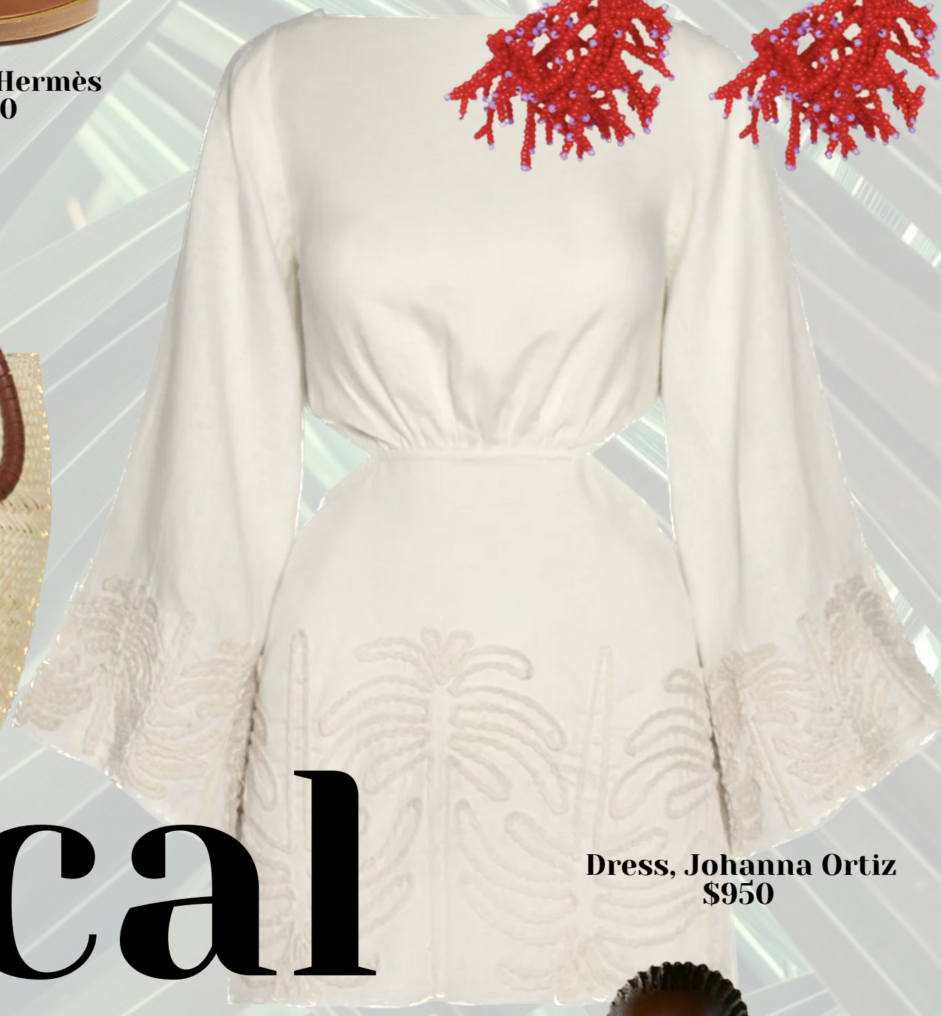
Dress, Johanna Ortiz $950