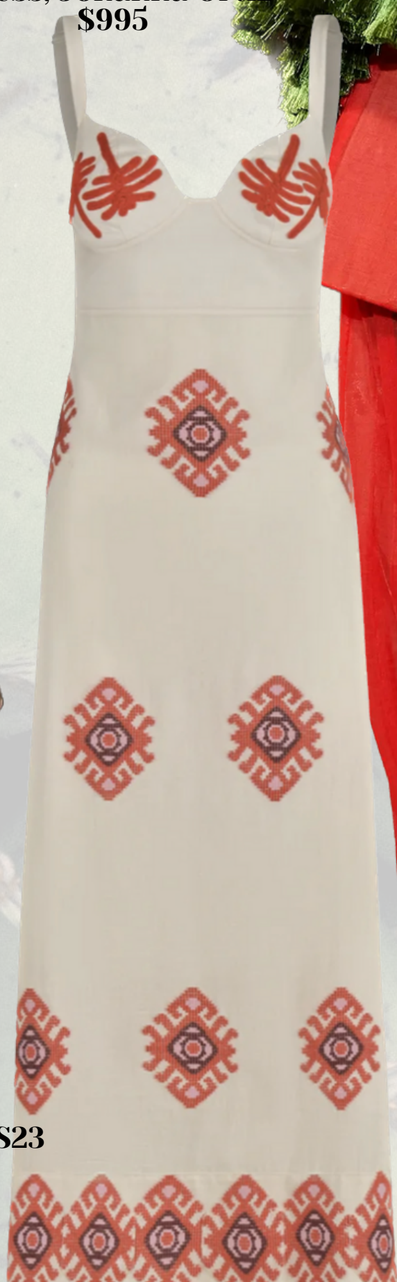
Dress, Johanna Ortiz $995