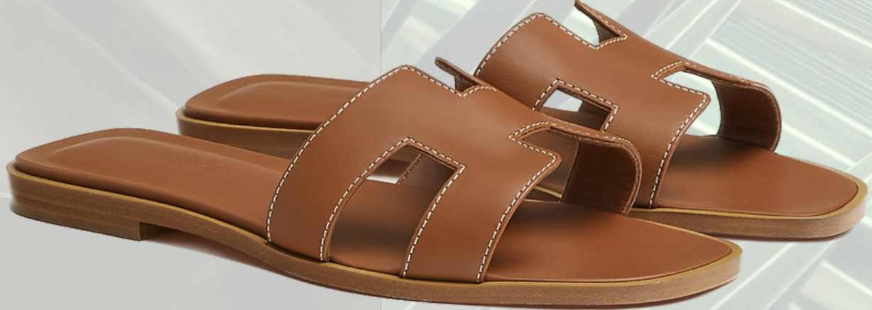
Sandals, Hermès $700