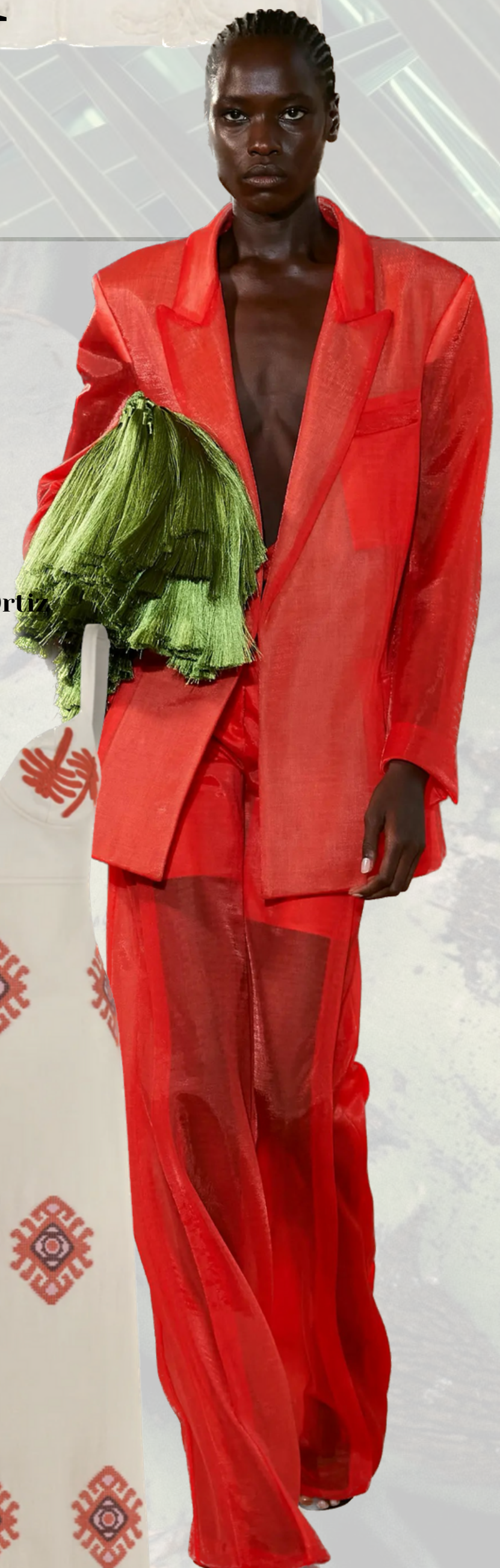
Victoria Beckham SS23