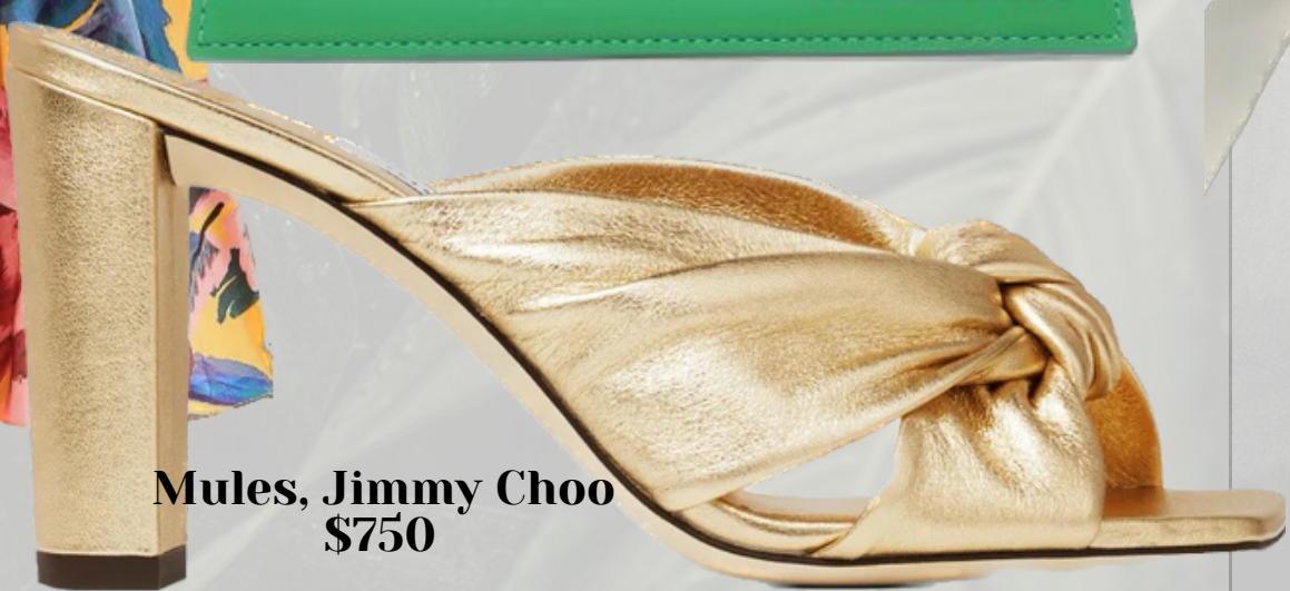
Mules, Jimmy Choo $750